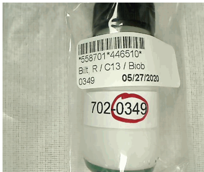
Package received - labeling COC

Laboratory Number Beta-558701 Percent modern carbon (pMC) 50.09 +/- 0.17 pMC Atmospheric adjustment factor (REF) 100.0; = pMC/1.000