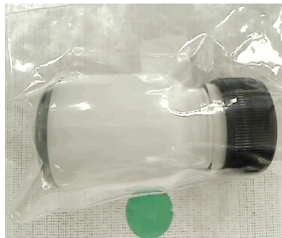
View of content (1mm x 1mm scale)