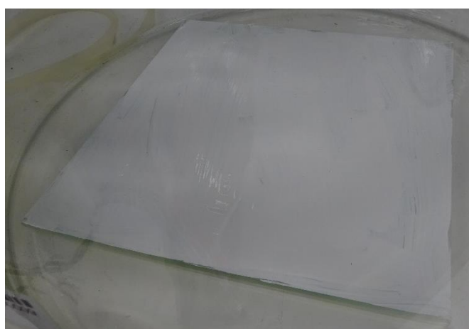
Photograph 1: test sample 89104 Copperant Altra Muurverf